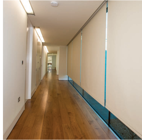
All the walls of this stunning home are floor-to-ceiling glazing; blinds can be operated from any of the touch panels and smartphones.